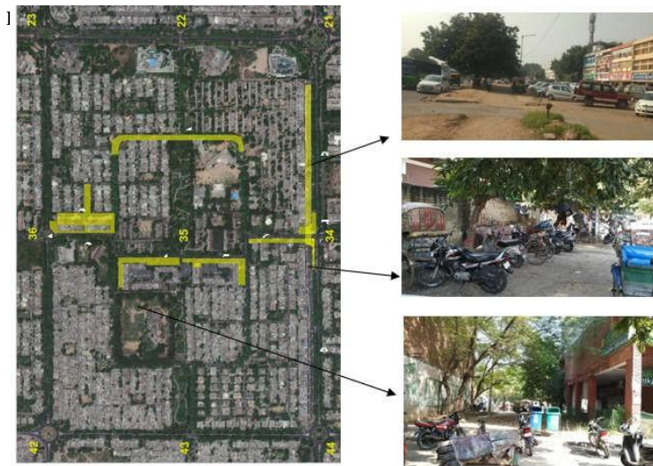
Figure 3. Identified pockets for Placemaking in Sector 35