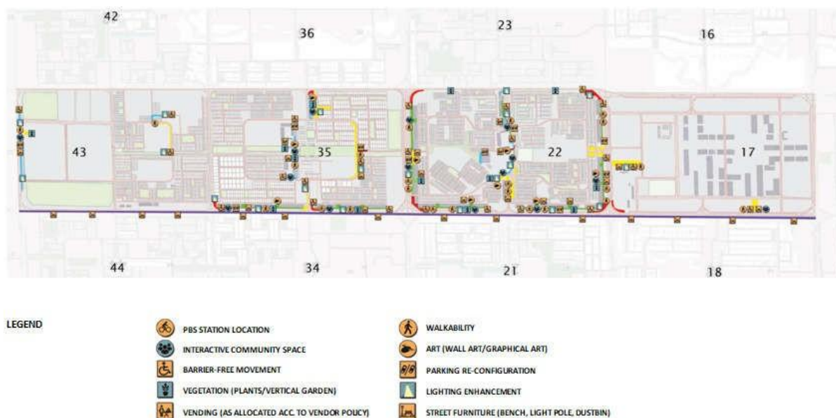
Figure 4. Existing pockets with holistic locations of proposed components throughout the study area

The figure 4 below gives a clear picture of the holistic locations of the components.