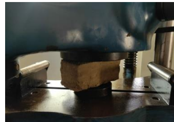
Fig. compressive test analysis