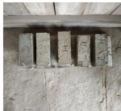
Fig. Drying of brick